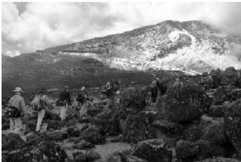
Hiking on Shira Plateau

Camp, we hiked and scrambled up a high wall to the Karanga Valley to acclimatize for another night. Most hikers go from here directly to Barafu camp. We arrived at the site at about 2:00. I tried to dry some of my clothes in the sun, but soon the clouds rose to our level and my efforts were only a partial success.