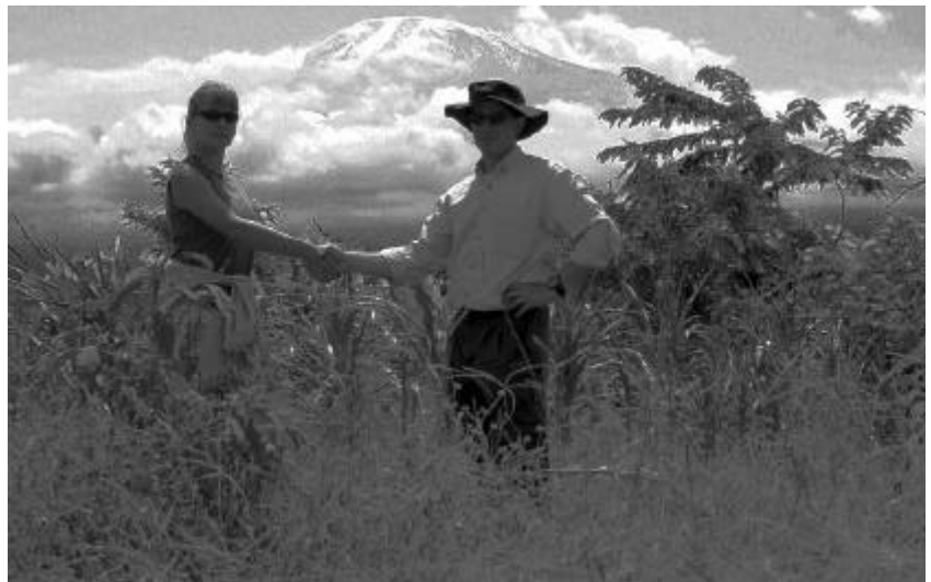
Kilimaniari in the distance

Day 4. Short Hike to Karanga Valley Camp at 13,450 ft or 4100m) 3:35 hours and 1660 ft gain. From Barranco